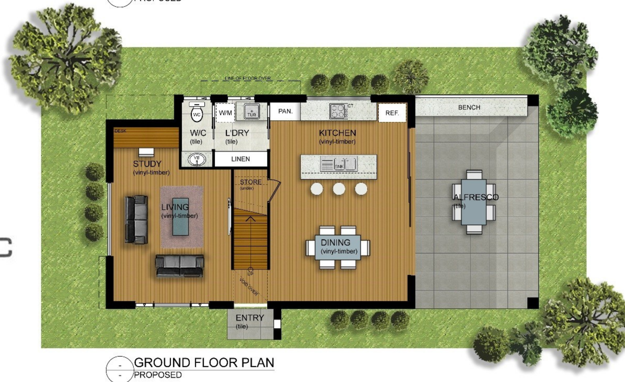
GROUND FLOOR PLAN PROPOSED